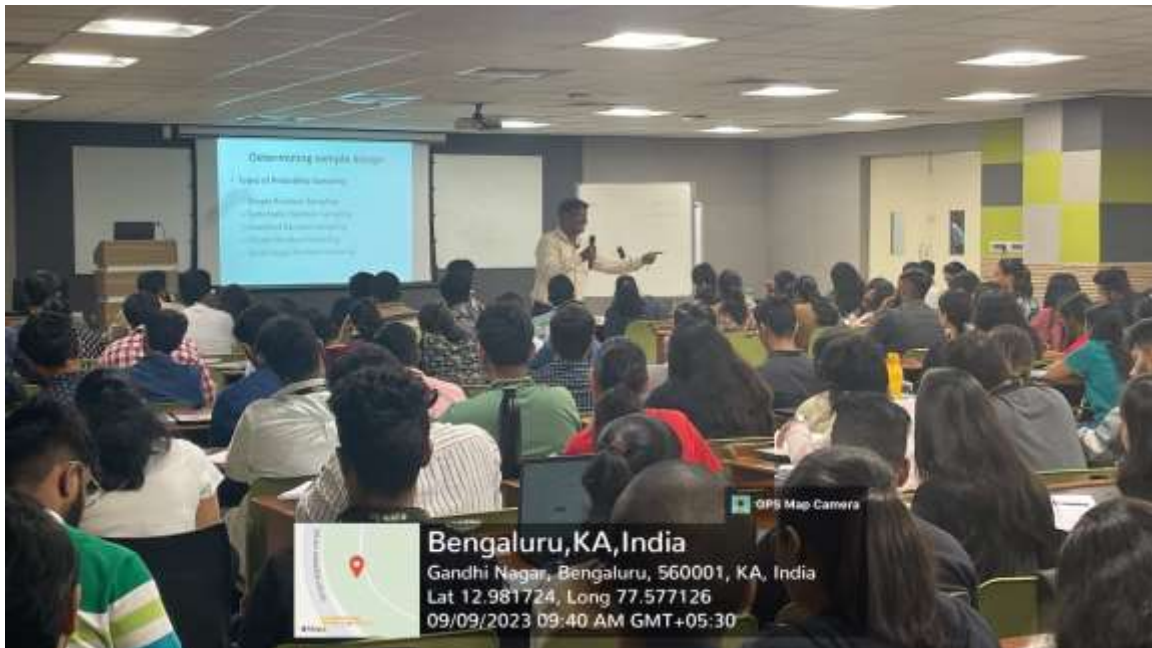
Fig: 1.2 Hands on training, workshop on Data Analytics and SPSS, held on September 9 th (Batch and Event: 2023-25; Programme: MBA, Semester I)