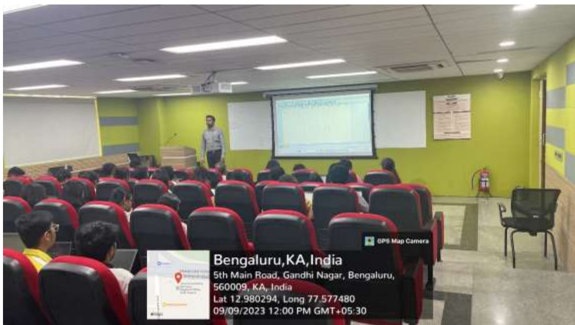
Fig: 1.6 Hands on training, workshop on Data Analytics and SPSS, held on September 9 th (Batch and Event: 2023-25; Programme: MBA, Semester I)