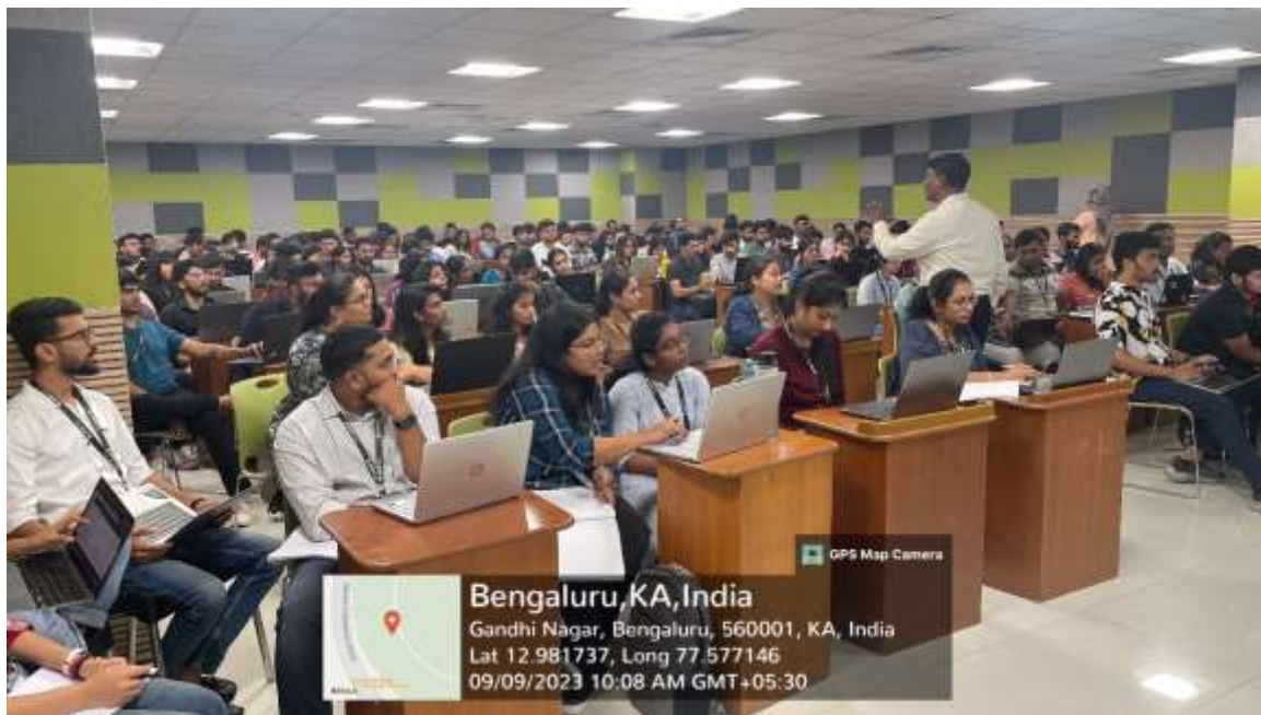
Fig: 1.4 Hands on training, workshop on Data Analytics and SPSS, held on September 9 th (Batch and Event: 2023-25; Programme: MBA, Semester I)