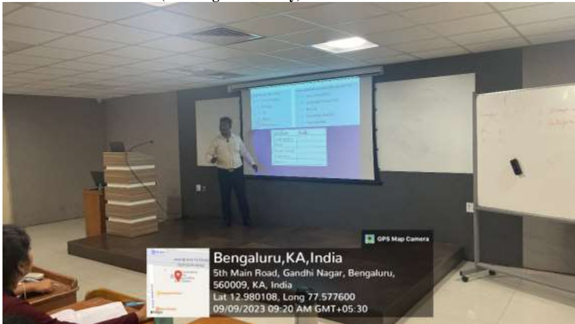
Fig: 1.1 Hands on training, workshop on Data Analytics and SPSS, held on September 9 th (Batch and Event: 2023-25; Programme: MBA, Semester I)