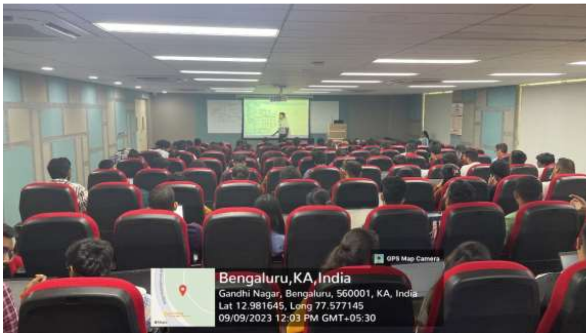
Fig: 1.10 Hands on training, workshop on Data Analytics and SPSS, held on September 9 th (Batch and Event: 2023-25; Programme: MBA, Semester I)