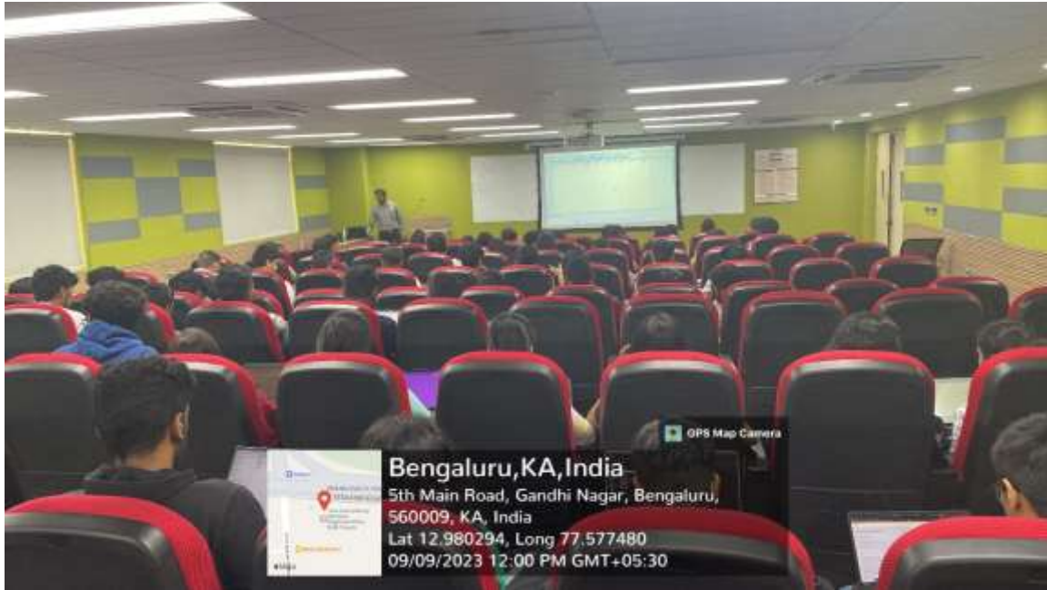
Fig: 1.5 Hands on training, workshop on Data Analytics and SPSS, held on September 9 th (Batch and Event: 2023-25; Programme: MBA, Semester I)