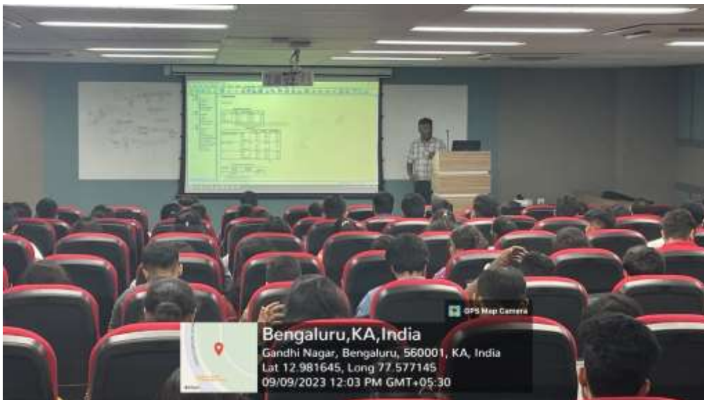
Fig: 1.12 Hands on training, workshop on Data Analytics and SPSS, held on September 9 th (Batch and Event: 2023-25; Programme: MBA, Semester I)