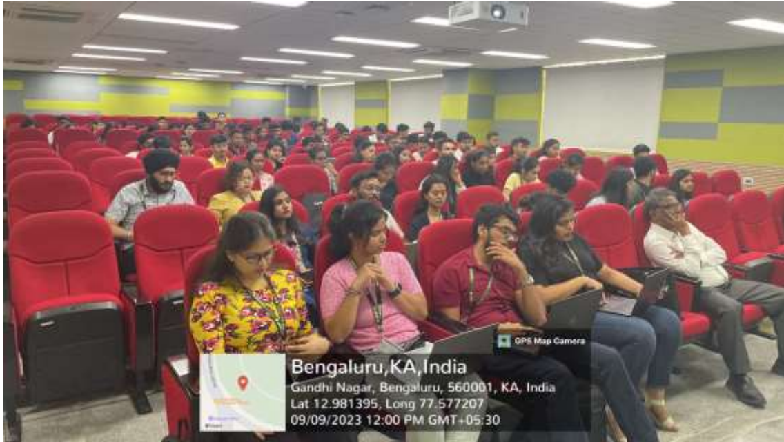
Fig: 1.7 Hands on training, workshop on Data Analytics and SPSS, held on September 9 th (Batch and Event: 2023-25; Programme: MBA, Semester I)