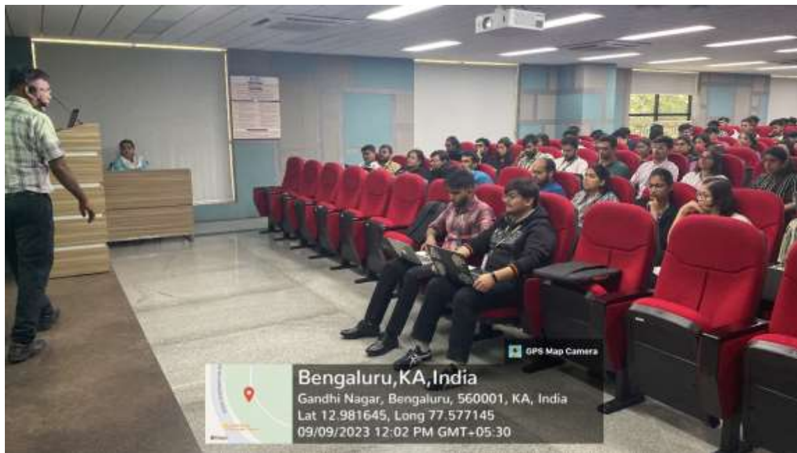
Fig: 1.8 Hands on training, workshop on Data Analytics and SPSS, held on September 9 th (Batch and Event: 2023-25; Programme: MBA, Semester I)