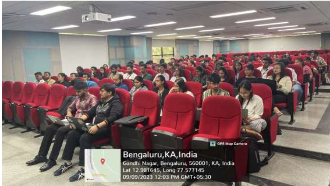
Fig: 1.9 Hands on training, workshop on Data Analytics and SPSS, held on September 9 th (Batch and Event: 2023-25; Programme: MBA, Semester I)