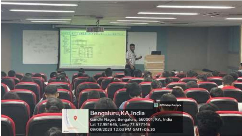
Fig: 1.11 Hands on training, workshop on Data Analytics and SPSS, held on September 9 th (Batch and Event: 2023-25; Programme: MBA, Semester I)